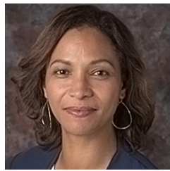
Deborah Flint CEO, Los Angeles World Airports

Honoring Deborah's successful leadership ensuring environmental sustainability is a key component of the LAWA's operations such as committing to reducing GHG emissions from LAWA owned and controlled sources by 80% below 1990 levels by 2050, establishing the Sustainable Design and Construction Policy and continually maintaining energy and water conservation trends even while passenger traffic continues to grow.