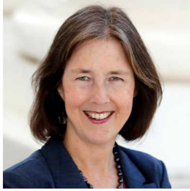
Nancy Skinner California State Senator

Friday, April 5 7:30 am - 2:30 pm | Getty Center Summit Featured and Invited Speakers