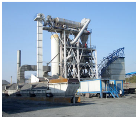
Above left: Shows a typical recycling plant in the U.S.

Recycling materials also can release pollutants and impact the environment. Toxins, chemicals, and solid matter can enter the atmosphere and water, degrading the ecosystem.