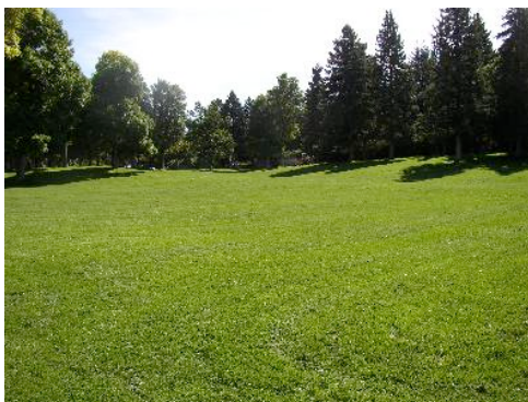
Above Right: Shows a park that

It is important to note that landfills are not open dumps for garbage. They are a carefully regulated and operated waste disposal system.