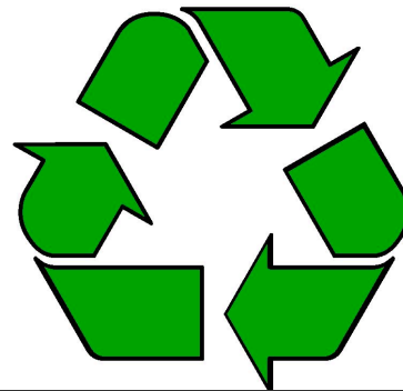
Above Right: Shows the symbol that an item is recyclable