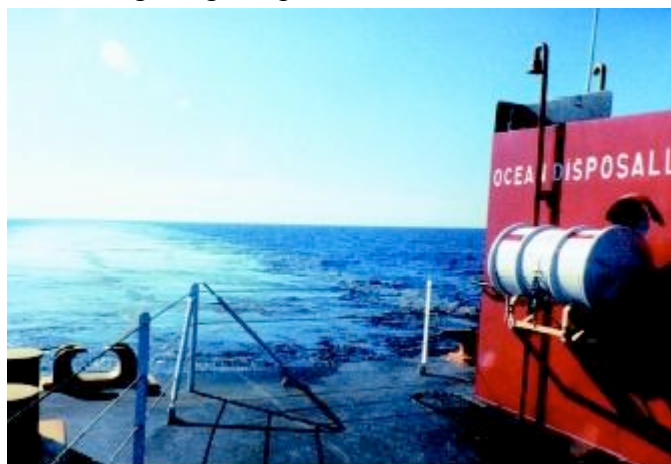
Above: Shows a picture of a ship carrying garbage to be disposed of in the ocean

Today people that use the ocean for recreational purposes are advised to avoid the site areas that were used for garbage disposal.