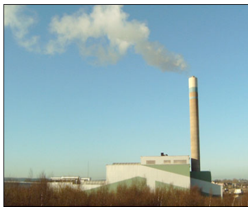
Above Right: Shows an Incineration building in England.

No changes in incineration need to be made across the seasons or during different weather patterns. There are also no strict land requirements to construct an incinerator.