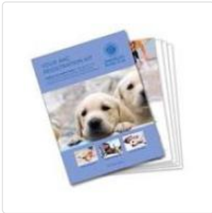
Puppy Information Folder (5 Pack) > $ 20.00