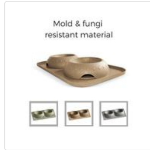
Rice Hull Dog Bowls & Tray > $ 49.99