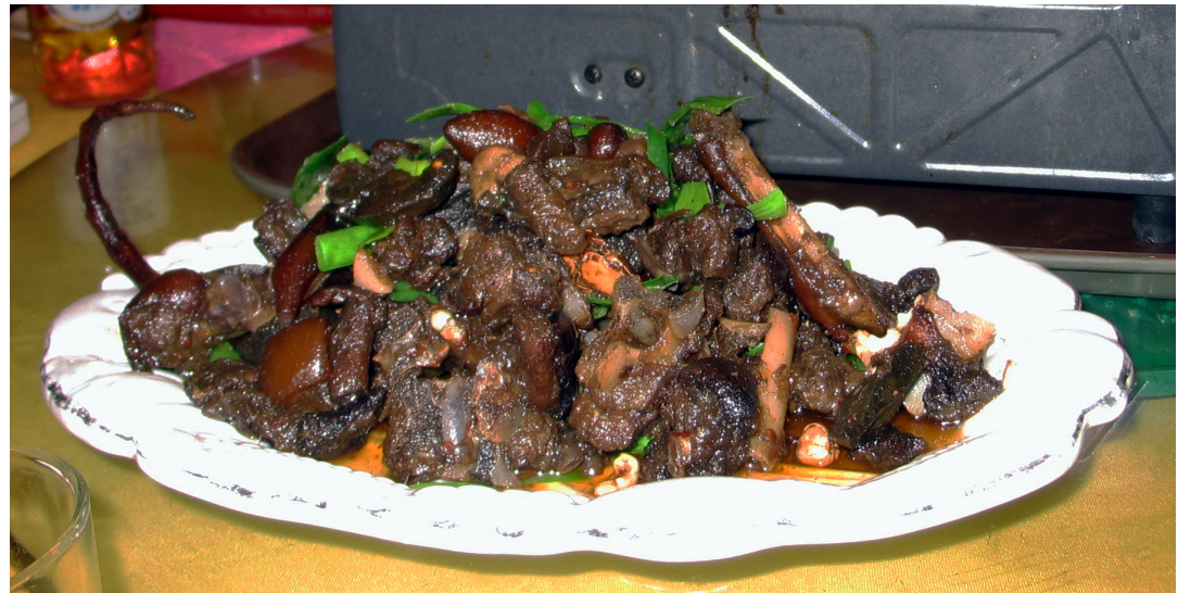
Dog-meat dish from Guilin. Tail used as decoration.

Dog meat is a regular item on menus in Korea, China, Indonesia, Mexico, Philippines, Polynesia, Taiwan, Vietnam, Switzerland, the Arctic and Antarctic.